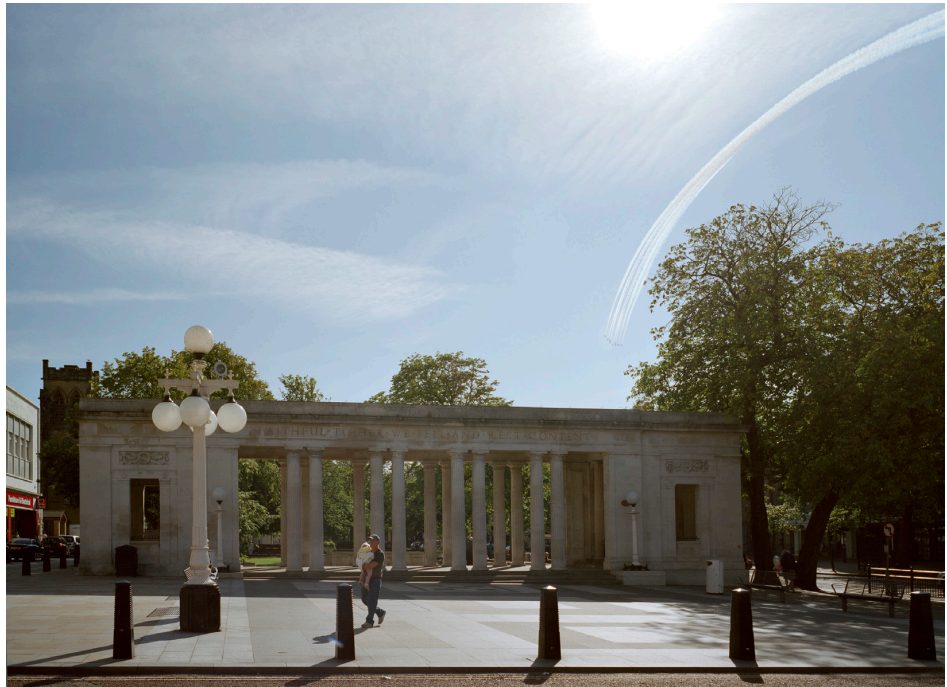
Southport War Memorial, Southport, Merseyside, UK with display by Red Arrow fighter jets, 23 July 2011. The lettering on the monument reads: 'Faithful to her we fell and rest content.'