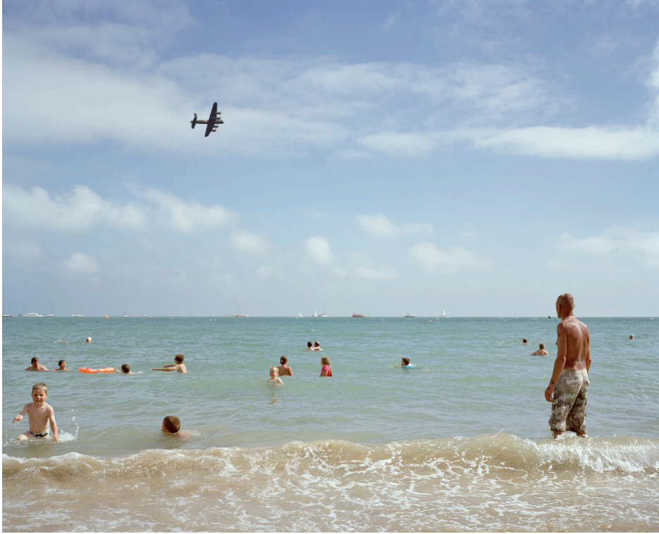
WWII Lancaster bomber at Eastbourne air show, Sussex, UK, 15 August 2010.