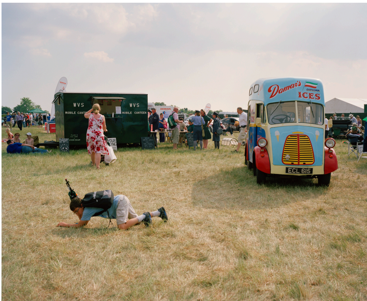
1940s mobile wartime canteen in 'living history' area, Biggin Hill International Air Fair, Kent, UK, 27 June 2009. All images © Melanie Friend/courtesy Impressions Gallery – from forthcoming book The Home Front .